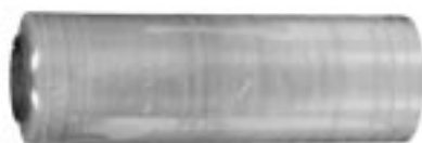
AN-SHRINK 16" STRETCH WRAP